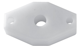
F2UH-UH - Series

Entire unit is UHMW-PE. USDA and FDA approved. -60° to 180° F temperature range. For wash down applications in wet or harsh environments or where sanitary conditions are a factor. Self-lubricating bearings resist corrosion, high impact and abrasion. Interchangeable with most metal units.